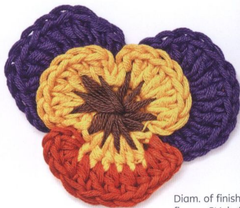
Diam. of finished flower: 2½ in (6.5 cm)

These flowers are a staple in any flower bed. They are so bright and colorful too, so you can't go wrong with the color choice. Use your imagination.